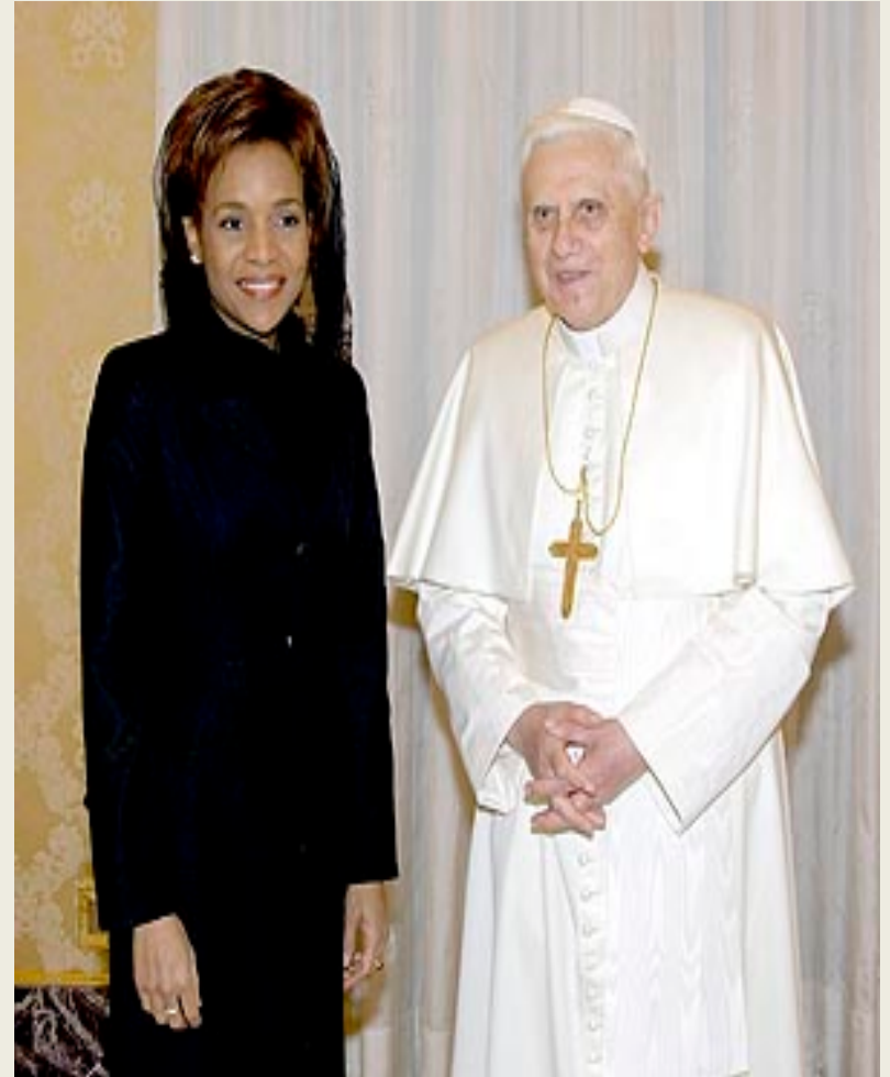
Michaëlle Jean, Governor General 2005-2010