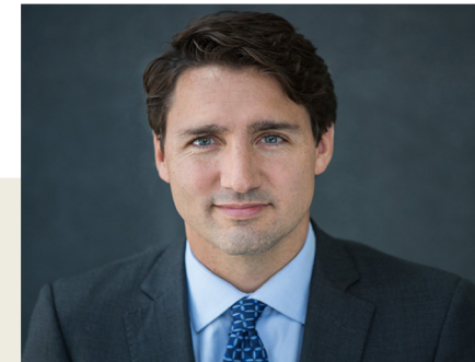
The Right Honourable Justin Trudeau Prime Minister