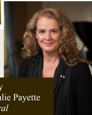
Her Excellency The Right Honourable Julie Payette Governor General