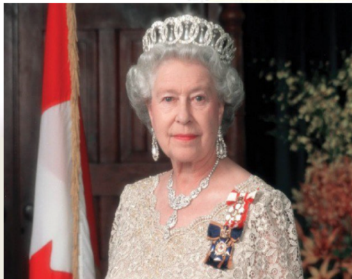
Her Majesty Queen Elizabeth II